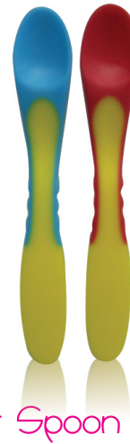
Heat Sensor Spoon

Description: Set of 2 Heat Sensor Spoon.