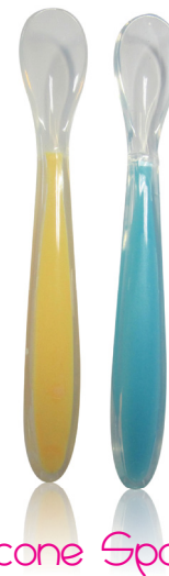
Comfy Silicone Spoon.