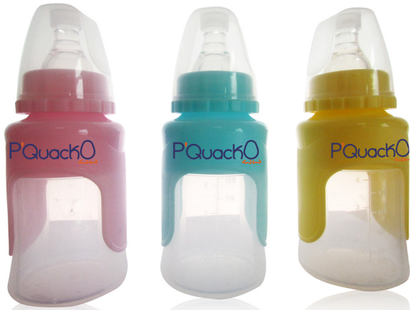
Squeeze-it Silicone Bottle with Cover