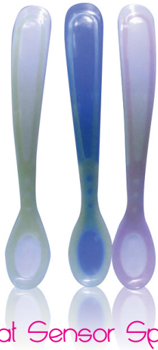
Soft Heat Sensor Spoon