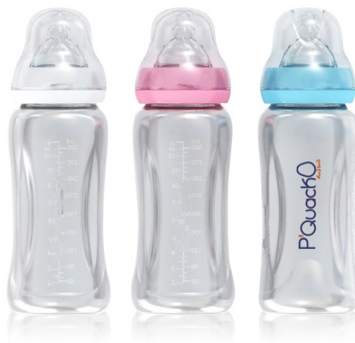
Wide Neck Bottle

Size: Regular Neck 8oz/237ml, Regular Neck 5oz/148ml.