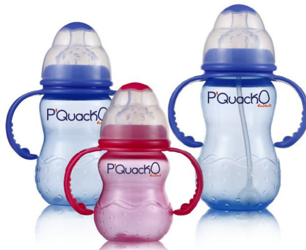
Bottles with Handler