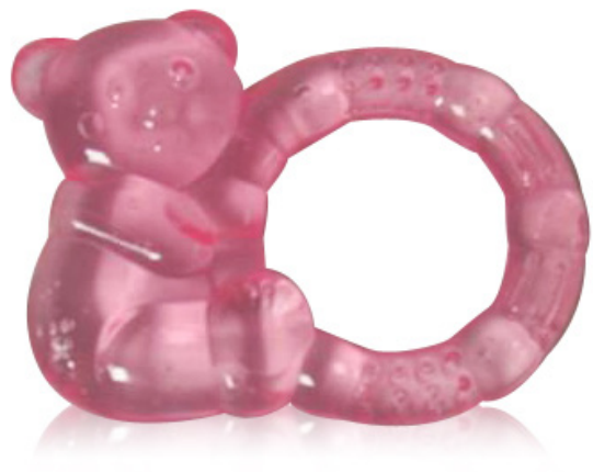
Teddy Bear Teether

Code: PQTH003 Material: Silicone. Color: Green and Red.