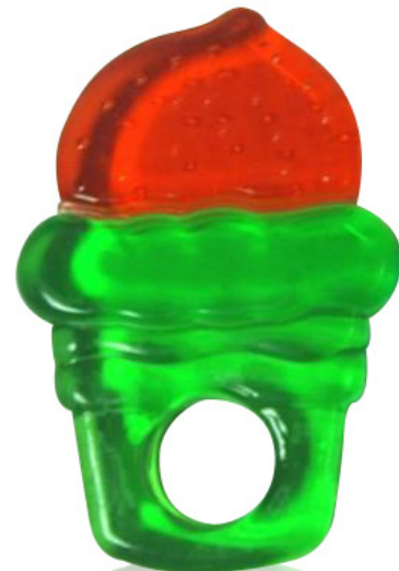
Ice cream Teether

Code: PQTH001 Material: Silicone. Color: Green and Red.