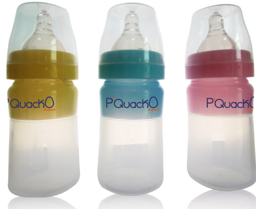
Squeeze-it Silicone Bottle

Size: Regular Neck 7oz/207ml, Regular Neck 4oz/118ml.