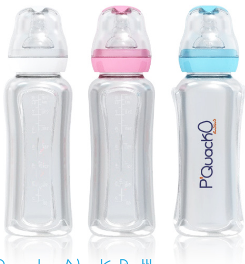
Regular Neck Bottle